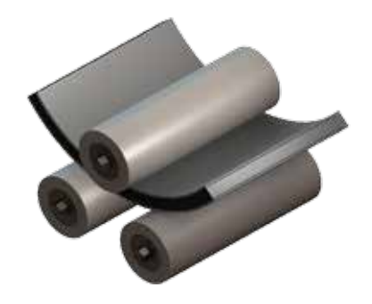
3-Roller panel bender is recommended for bending large internal diameters.